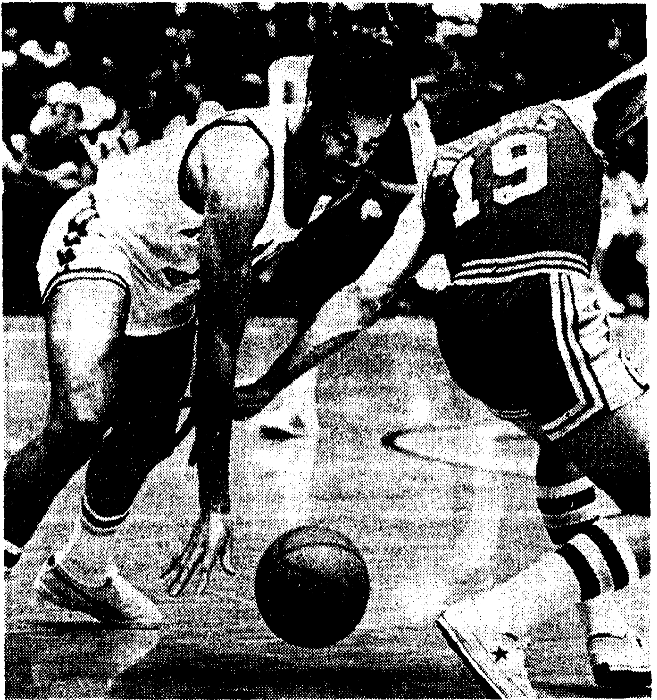
Knicks' Walt Frazier stealing ball from Cavaliers' Lenny Wilkens (19) in second period