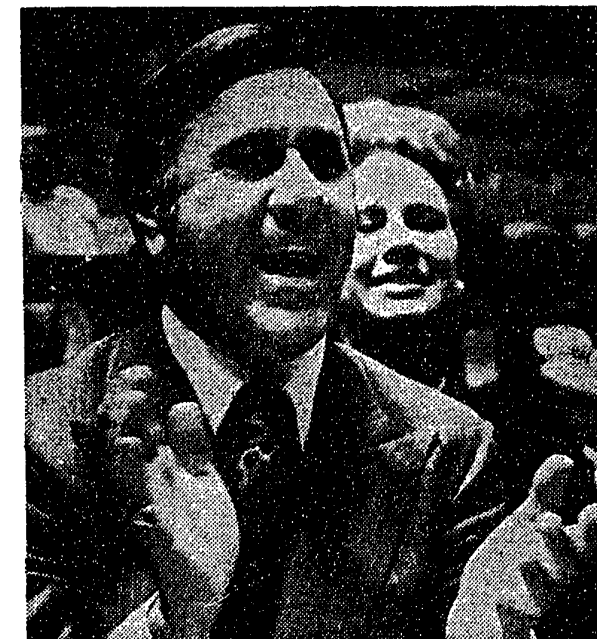
Oral Roberts, the Methodist minister after whom the university is named, following the game at the Garden.